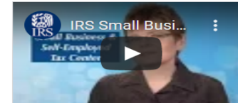
IRS Small Business Self-Employed Tax Center YouTube Video