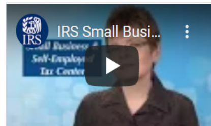
IRS Small Business Self-Employed Tax Center YouTube Video