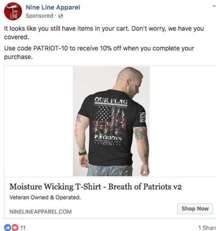
Example of an ad targeting visitors who abandoned cart.

Set up a cart abandonment campaign in Facebook to target people who visited your shopping cart page. We recommend offering them a small discount to convince them to complete the purchase.